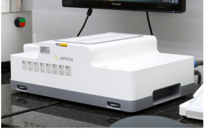
Picture 2. SpeedCal mobile is available with either 4, 8, or 12 channels, with the option of subsequently adding up to 12 channels.